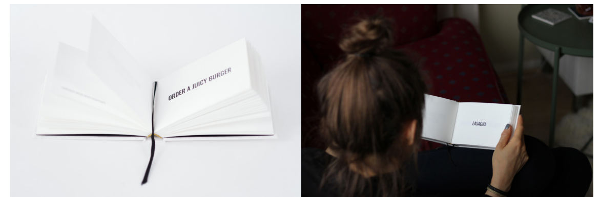
The self-help book makes it easy to choose