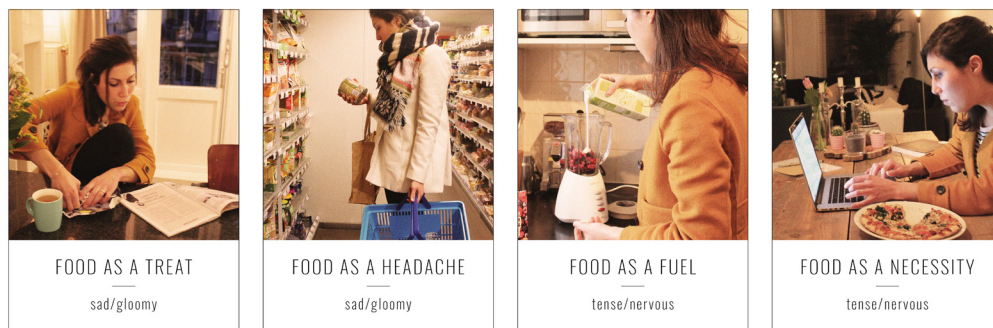
The 24 forms of emotional eating

You're feeling a little stressed and have busy day ahead of you. You can use a little confidence booster. The modular smoothie recharges you both mentally and physically. Each capsule is filled with specific ingredients. Go for quick results or combine capsules to get the exact nutritional combo you need. Select the capsules you need, click them together, shake, drink, and you're ready to go.