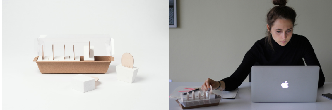
The bite-sized meal is easy to chew on