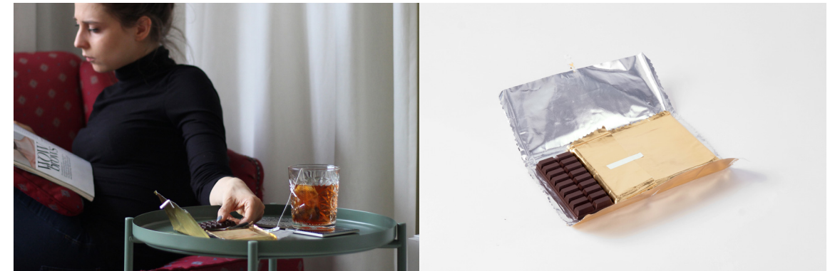
Seven presents in one chocolate bar