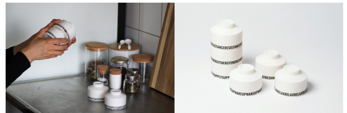
A modular smoothie for a quick pick-me-up