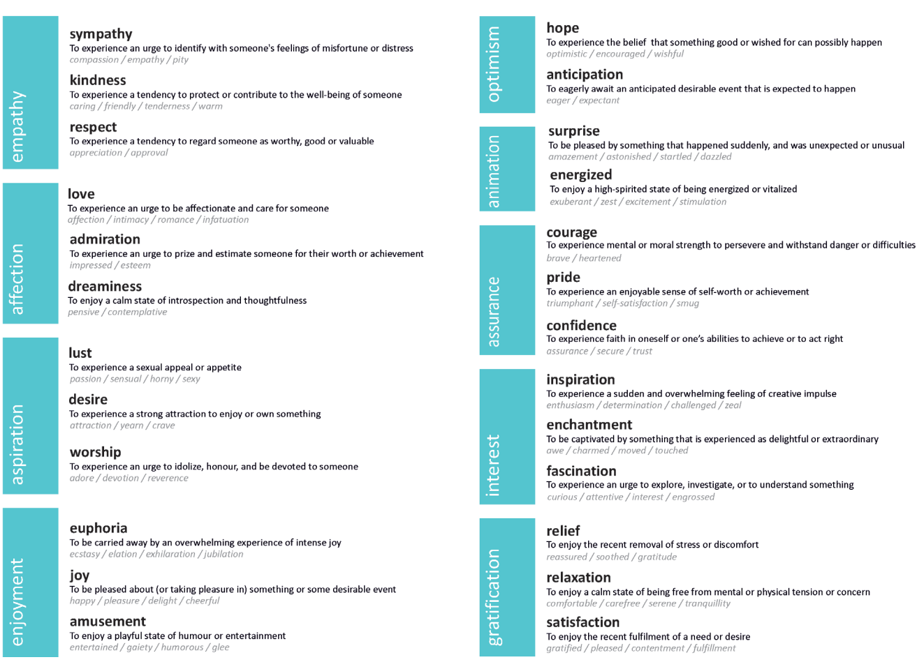
Figure 1. General typology of 25 positive emotions.